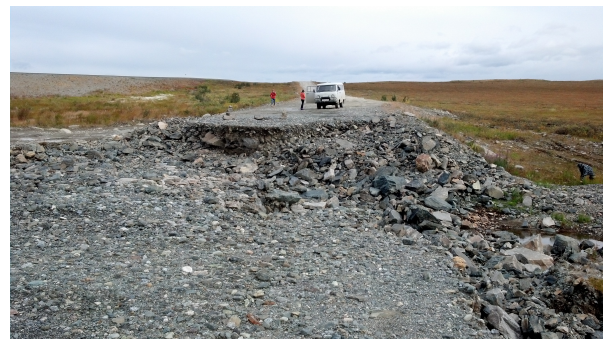
The team endures horrendous road conditions