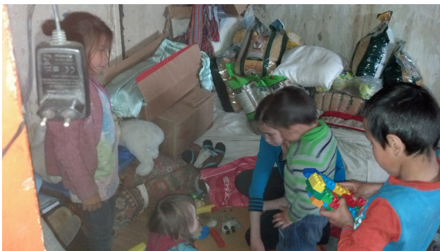
Children thrilled to receive toys as well as food and clothing