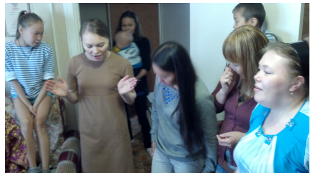
Passionate believers worship in their homes