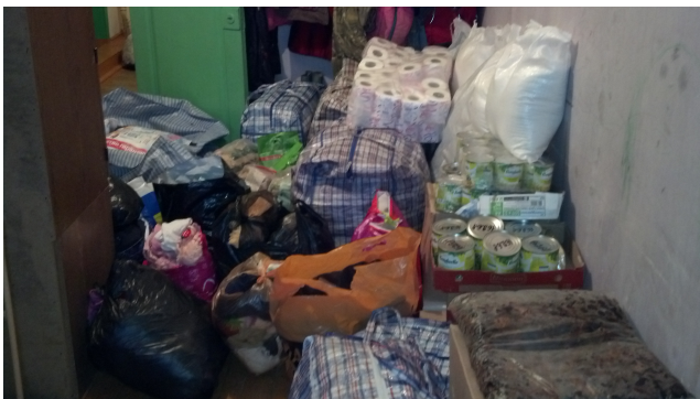
Generous aid delivered to poor families