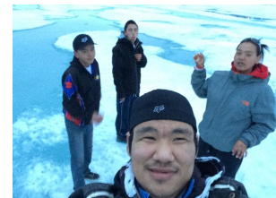
Hope is building in Arctic Hope participants

The second series of the 5-year AHP in Cape Dorset is about to begin. It is designed to minister to first-time participants, plus build on the foundation laid in the initial sessions. Many youth are clamouring to attend because of the transformation they have seen in the first group. They are discovering what real hope accomplishes!